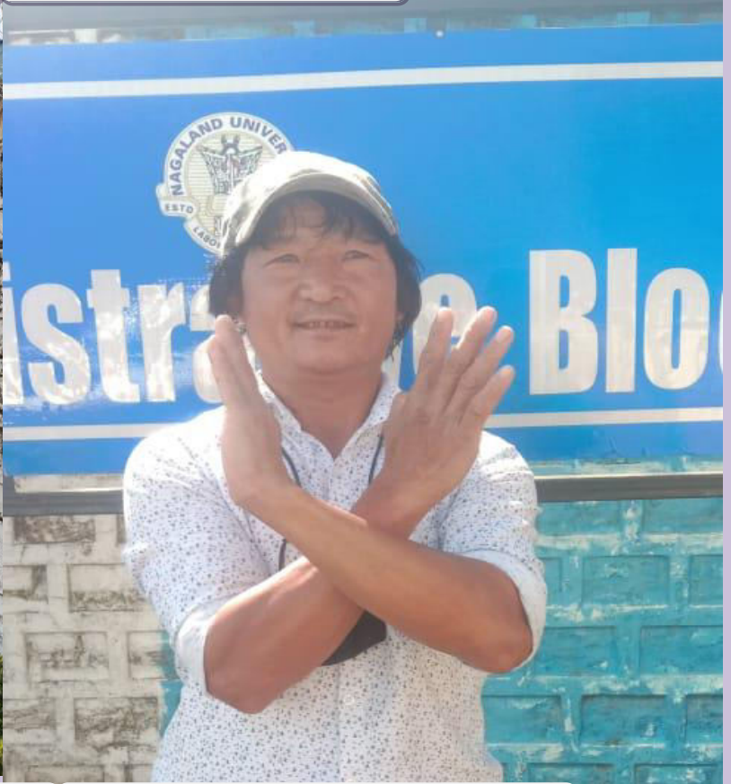
Non Teaching Staff