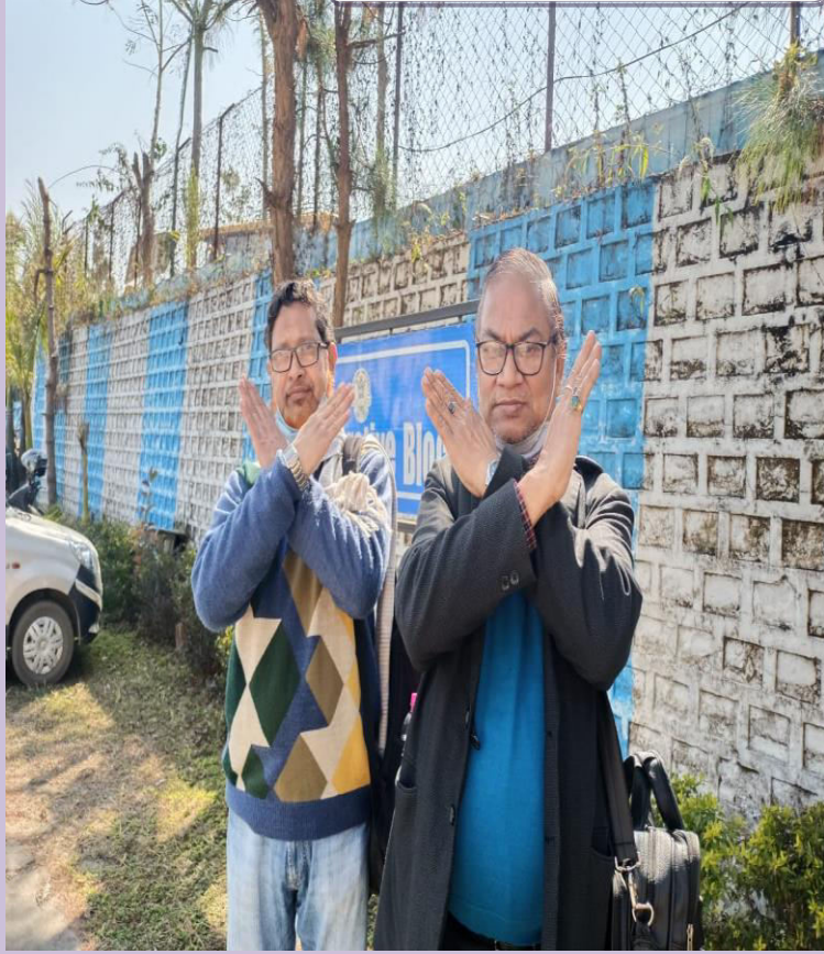
Dept of English