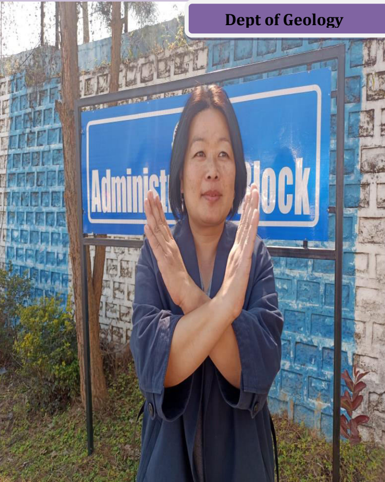
Dept of Geology